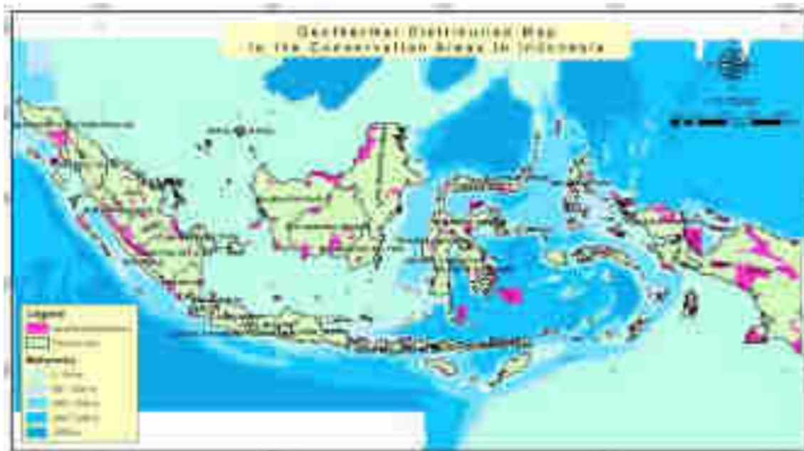
Fig. 4. Map of Geothermal Potential in Conservation Areas.

development in utilization zones. Many of the geothermal sites in Nature Reserves, however, are located within the core zones, initiating further efforts to push the envelope of possible utilization or to redraw the zoning boundaries (Mongabay, 2016).