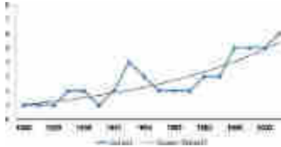
Fig. 3. Time line of conservation bureaucracy in Indonesia. Level of bureaucracy: as a task force (small committee unit) = 1, as the unit responsible for specific conservation task = 2, as the section under division of direcorate general = 3, as the division/direcorate under Direcorate General = 4; as the direcorate General focusing in conservation mix with other issue element and directly under Ministry = 5, as the Direcorate General focusing only on conservation issue element and directly under Ministry = 6.